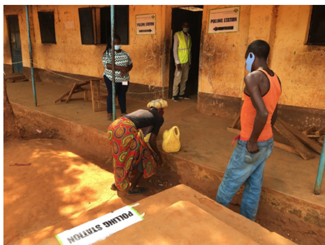
Woman washing hands with improvised sanitation device, Machakos

cleaned their hands with soap and water, and should have applied sanitizer to them, so adding further sanitizer prior to re-attempting to verify the voter's identity only risks damaging the KIEMS. Indeed, some polling staff (the vast majority of whom were in Machakos) reported that they had been specifically instructed by the IEBC not to clean the KIEMS with sanitizer due to concerns that the machines may be broken. 62 If correct, this contradicts the IEBC tweet that said the KIEMS kit would be sanitized by the clerk after every voter had been successfully identified. On this topic, the US-based Centres for Disease Control and Prevention provides the following in their recommendations for election officials and poll workers: "Alcohol-based hand sanitizers may not be compatible with electronic voting equipment and may damage paper ballots. Poll workers and voters should ensure their hands are completely dry before handling these items." 63 It is unclear whether hand sanitizer played any role in slowing the KIEMS voter identification process during the Kabuchai and Matungu by-elections, but it is evident that the queues built up when voters could not be identified quickly. Where no issue was identified with KIEMS, voting took on average three minutes from entry to exit of the polling station. 64 Where KIEMS was a problem, voting took considerably longer. When voters have to spend longer queuing, this obviously increases the risks of contracting or transmitting COVID-19.