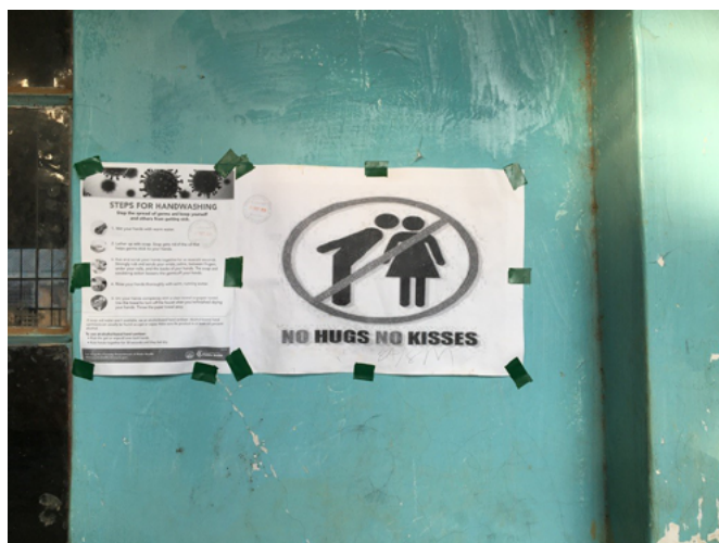
Public health warning signs from the Los Angeles County Department of Public Health (USA), in a Matungu primary school

The specific guidelines pertain to: voter registration; conducting an election; and the post-election period. 21 The guidelines on voter registration are not discussed here because a fresh voter registration process was not undertaken in advance of the March 2021 by-elections, for which the voter register from the 2017 general elections was used. The guidelines on the post-election period are also not covered here because they amount to only three sentences simply indicating that measures should be taken to prevent exposure to COVID-19 during the collection and storing of electoral materials. 22 This working paper focusses on the two stages of conducting an election that the IEBC COVID Protocols define as 1) the 'pre-election period' and 2) the 'election period'. The Protocols offer the most detail on activities conducted during the election period, which they define as 'election day'. 23 According to the Protocols, the pre-election period runs from the issuance of the election notice through to the testing of equipment and includes campaigning. 24