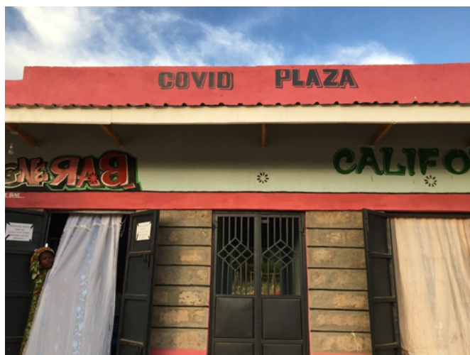
COVID Plaza (Kyanguli, Machakos County), where patrons are to observe pandemic protocols upon entry

The Kabuchai and Matungu constituencies in Western Kenya had 57,476 and 61,728 registered voters respectively, compared with the five smaller wards that total 94,216 registered voters. 12 The Machakos senatorial by-election had 622,965 registered voters across 8 constituencies. 13 The Western constituency by-elections were the focus of political campaigns that included the support of senior party leaders who were seeking to heighten their standing on the national stage ahead of the forthcoming general elections. As a result, the by-elections were less about the local candidates than they were about the figures behind them, for whom a loss would have been damaging to their future political bids or bargains. 14 Among those who campaigned in Western in the run-up to the polls were Deputy President William Ruto, leader of the opposition Raila Odinga of the Orange Democratic Movement (ODM), Amani National Congress (ANC) leader Musalia Mudavadi and Moses Wetang'ula (FORD-Kenya), all of whom hoped that wins for their party candidates would improve their standing in the race to replace President Kenyatta. 15 The main parties ultimately retained their seats, with FORD-Kenya holding Kabuchai and ANC holding Matungu, with a turnout of 51% and 54% respectively. 16 The Machakos senatorial by-election was a more subdued affair, with the Wiper candidate winning by a landslide – albeit on a turnout of 19%.