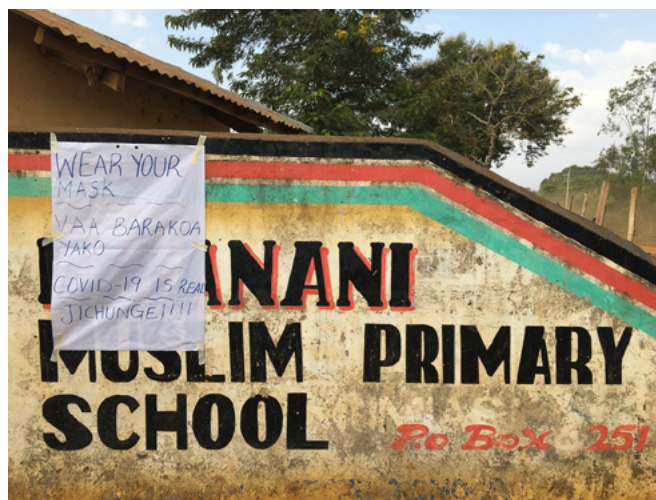
Sign outlining COVID-19 protocols at polling centre entrance, Emanani, Matungu