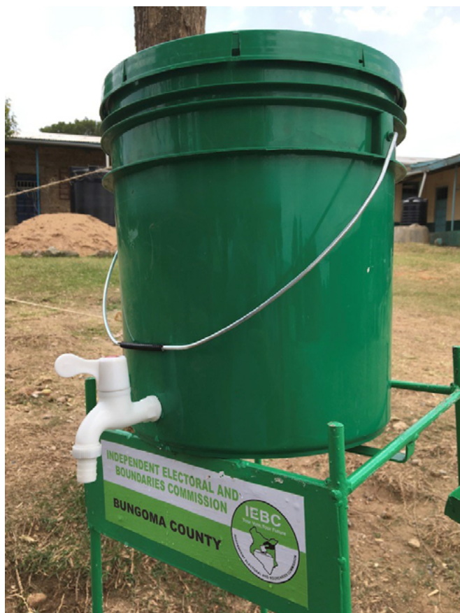
IEBC-banded water bucket, Chebunyinyi, Kabuchai

This was in stark contrast to Machakos, where some polling stations had no bucket, soap or water available for voters to wash their hands, and hand sanitizer was only applied when the voters left the polling station. 55