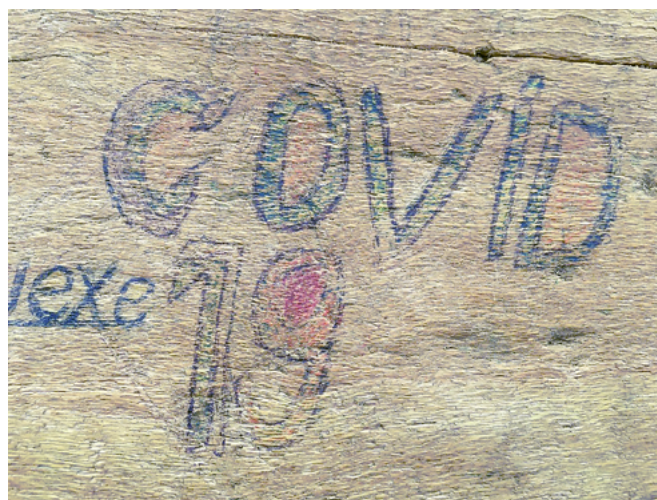
Graffiti on primary school desk, Mavoko, Machakos County